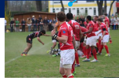
Defending from set piece