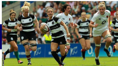
Recapping general game play