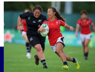
Ball handling & Go forwards