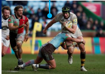
Tackling and preparing for contact